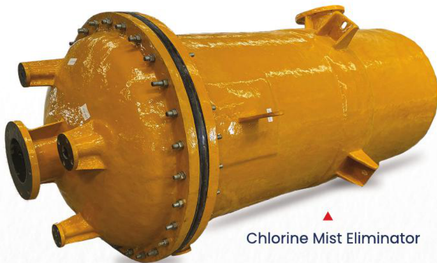
▲ Chlorine Mist Eliminator