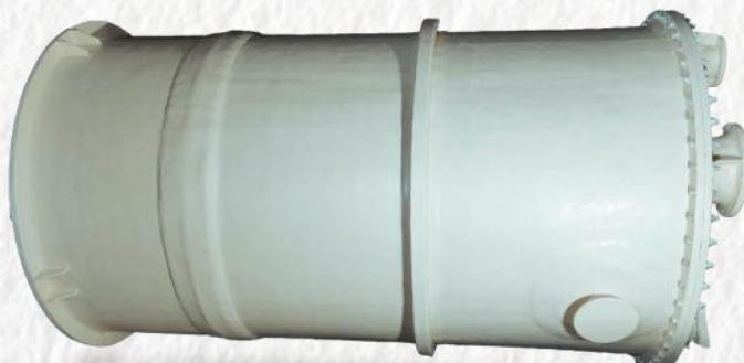
▲ PP FRP Scrubber