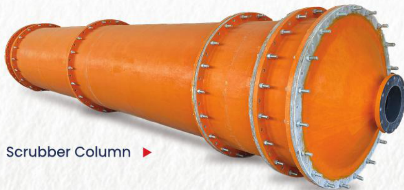
Scrubber Column ▶