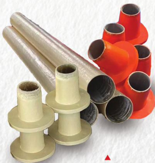
▲ PP FRP, FRP Piping & Moulded Fittings