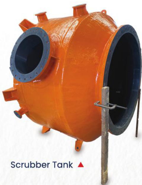
Scrubber Tank ▲